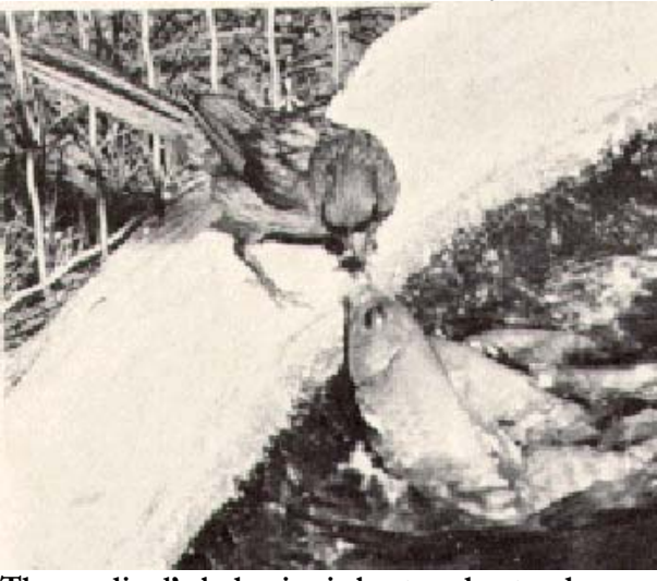
The cardinal's behavior is best understood as:

31. In the picture below – taken from the work of N. Tinbergen – a cardinal feeds minnows, which rose to the surface looking for food. The bird fed the fish for several weeks, probably because its nest had been destroyed.